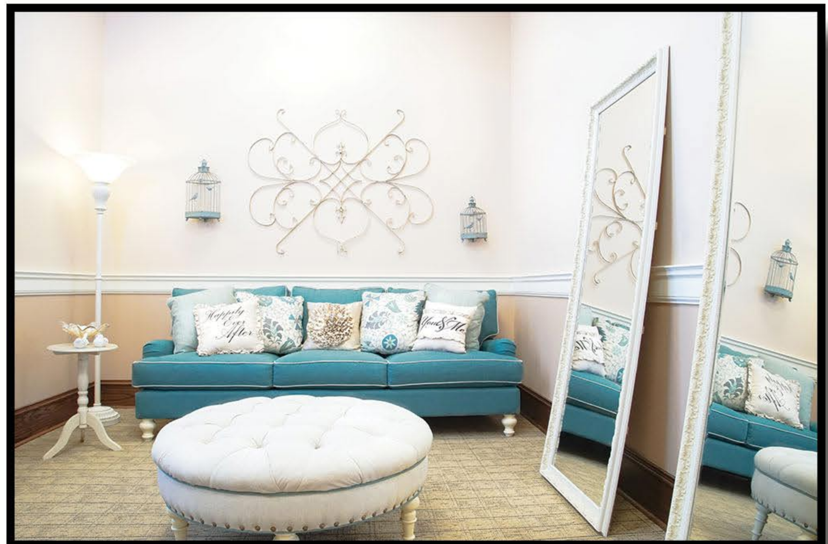
“Something Blue” Bridal Suite