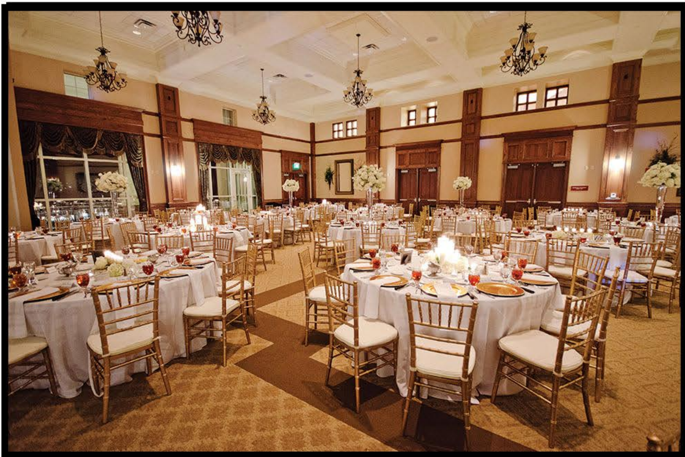
Phillip Beard Ballroom

Smoking - Smoking and vaping is prohibited inside the Buford Community Center, Town Park & Theatre.